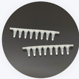
Bead or Cake in 8-strip tube

Our lyophilized premixes are available in cake or bead form to suit your specific requirements. Whether you need 8-strip tubes, 96-well plates or bulk bottles, we can serve you with consistent quality and performance.