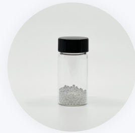
Beads in bottle

Say goodbye to storage and delivery concerns with our stable lyophilized premixes. Designed to be stable at room temperature, they eliminate the need for cold chain transport and are easy to store. The high stability of lyophilized reagents also means they can be used in remote areas with limited infrastructure, and make it ideal for developing point-of-care diagnostic product.